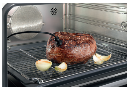
Wired roast probe for the perfect roasting results